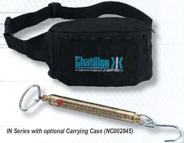
IN Series with optional Carrying Case (NC002845)