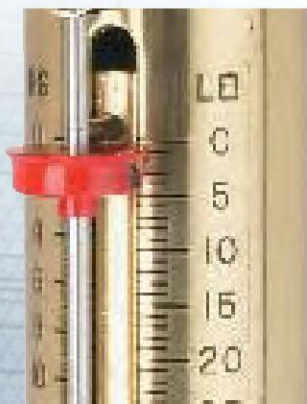
Maximum Reading Pointer