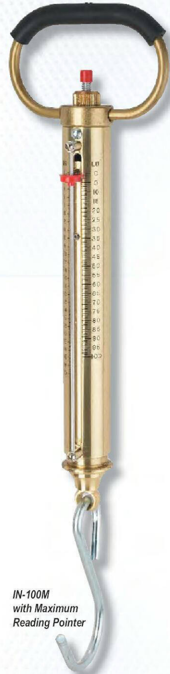
IN-100M with Maximum Reading Pointer