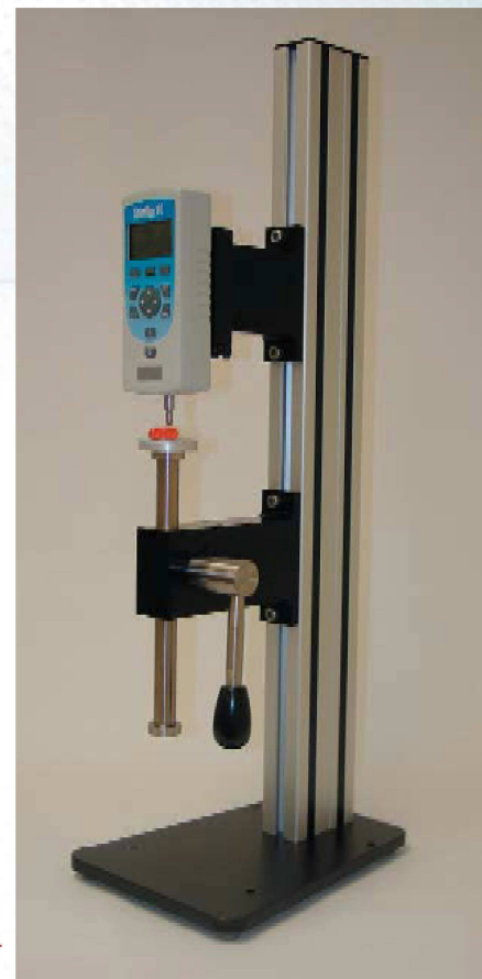
MT500L Lever-Actuated Tester with DFS Series force gauge, performing capsule crush test.