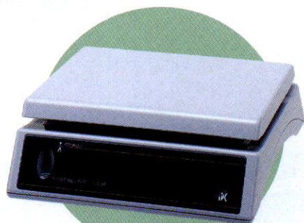
Dual Display Model