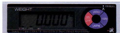
Large Display Panel

Answering the call for simplicity, portability and reliability...the iPC delivers exceptional all-around performance.