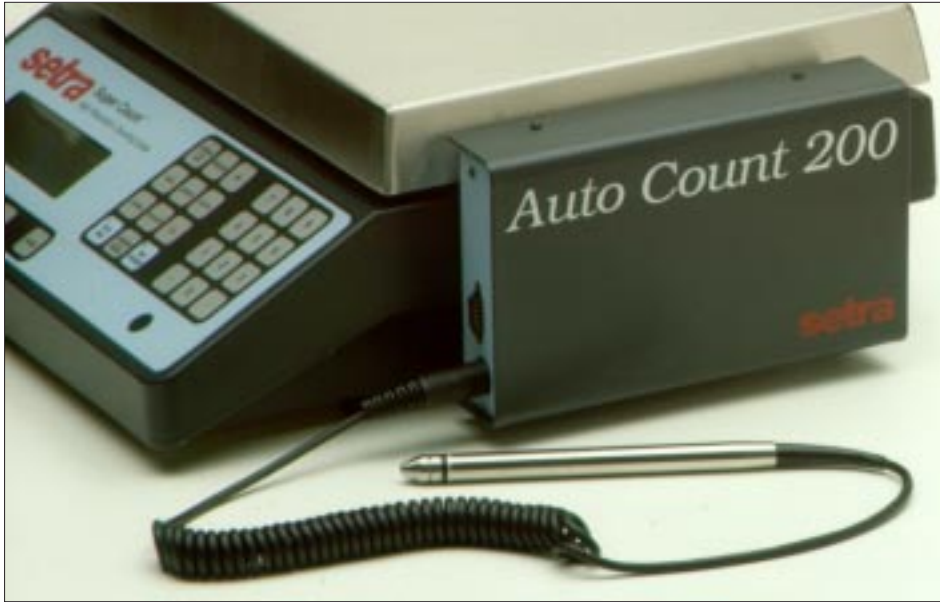
Auto Count 200 mounted to battery operated Super Count scale for portability

Low-cost bar code printing is a primary benefit of the Auto Count 200. The Auto Count 200 can be used with an inexpensive dot matrix printer which gives flexibility in choosing a label size.