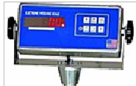
Easy-to-read, bright red display. Adjustable tilt bracket.